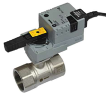
Trane Control Valve (Option)