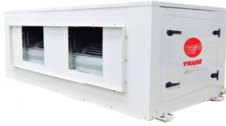
DWHA with access door