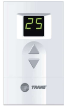
Proportional Thermostat (Option)