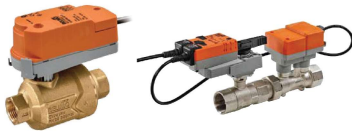
PICV Valve (Otipon)