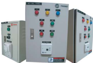
AHU Starter Panel (Option)