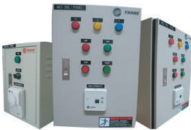
AHU Starter Panel (Option)