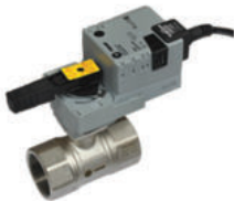
Trane Control Valve (Option)