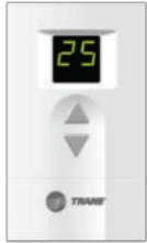
Proportional Thermostat (Option)