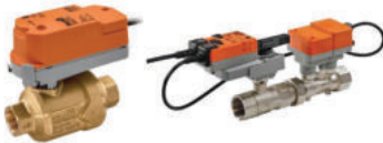
PICV Valve (Option)